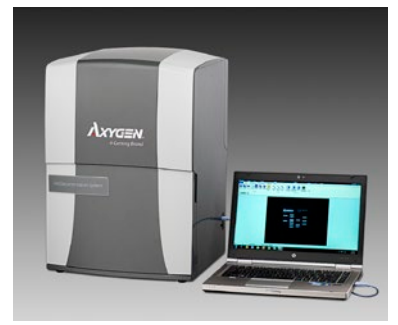
Axygen Gel Documentation System

Axygen® Gel Documentation systems easily capture publication quality, 16 bit TIFF images. The systems are quick to set up and have an intuitive user interface for image capture, annotation, and contrast adjustment. Images are easily saved and opened in common gel analysis software for more detailed analysis.