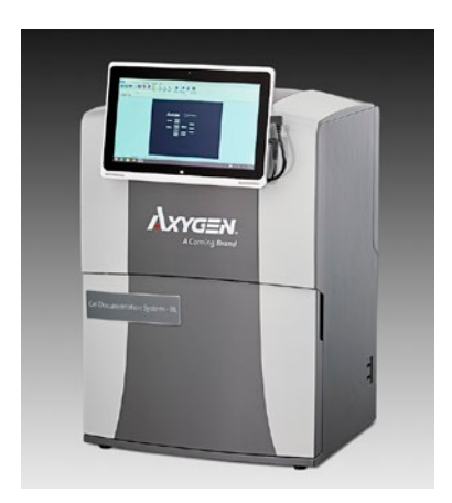
Axygen Gel Documentation System-BL